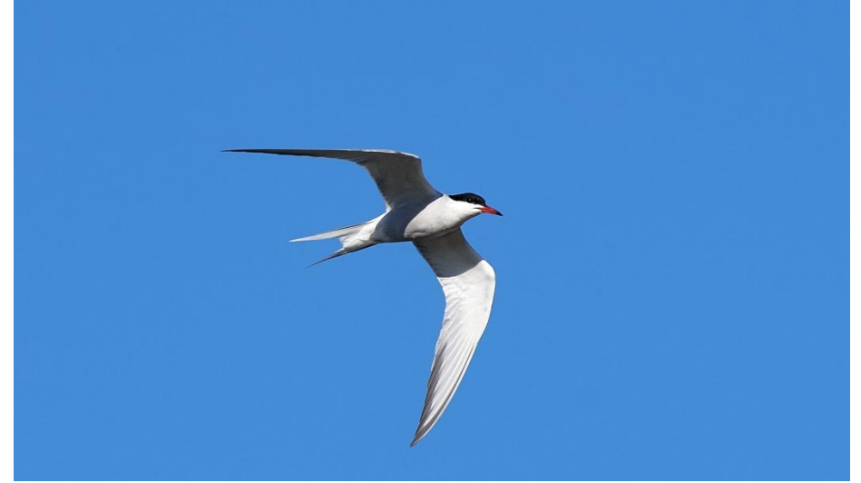
Common Tern ( Sterne pierregarin )

The total of bird species on the property that are assessed to have a special conservation status by the Committee on the Status of Endangered Wildlife in Canada (COSEWIC) and that are listed under the Species at Risk Act (SARA) remains at 9. These include the Bicknell's Thrush, Chimney Swift, Eastern Meadowlark and Wood Thrush which are assessed as threatened as well as the Barn Swallow, Bobolink, Common Nighthawk, Eastern Wood-pewee and Rusty Blackbird which are assessed as special concern .