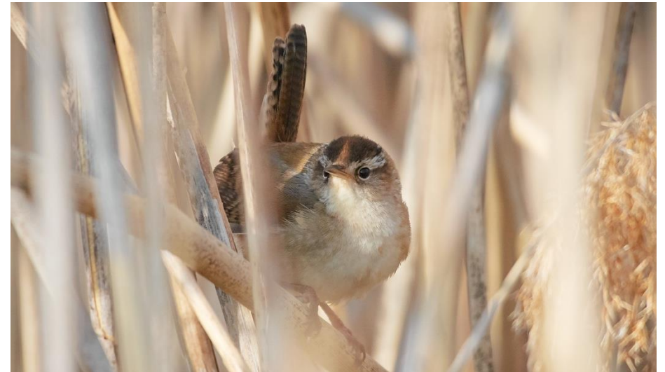
Marsh Wren ( Troglodyte des marais )